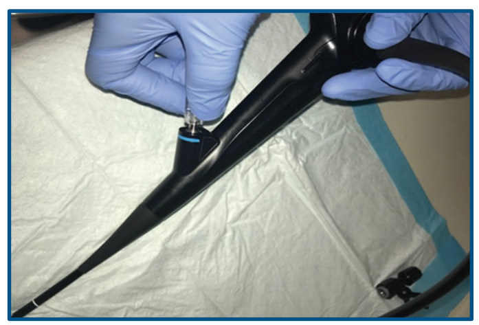
4) Open new connector kit and install port connector on the tubing set. Gently thread on luer-lock connector.