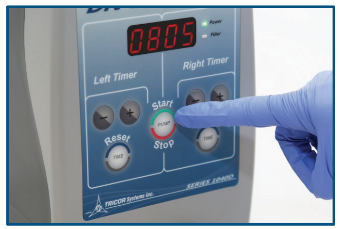
6) Press START button to begin airflow.