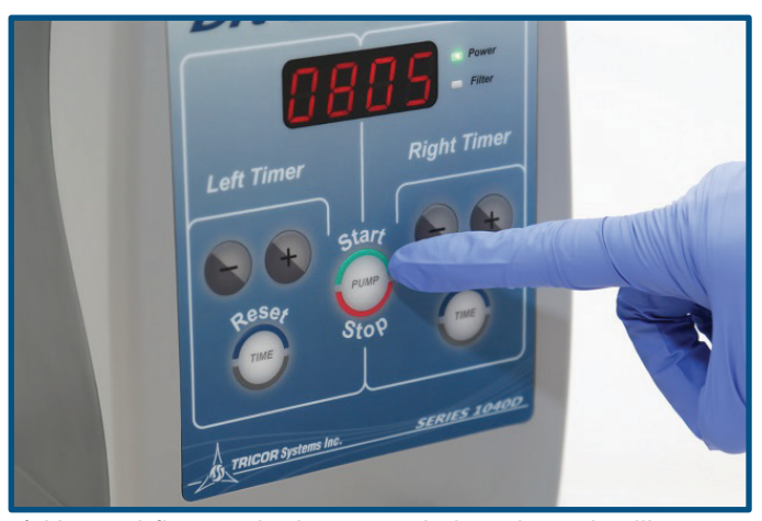
7) Upon airflow cycle time completion, the unit will automatically cease operation. Select RESET to restart the timer for the next cycle.