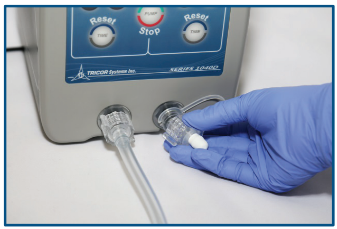
2) Install the included air output cap on the opposite port if only running one endoscope.