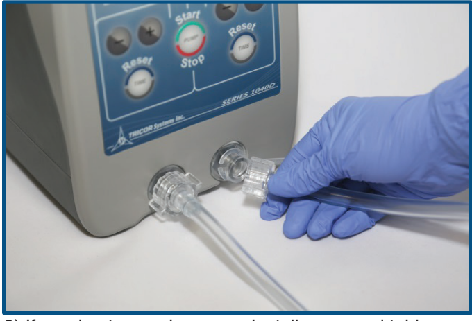
3) If running two endoscopes, install a second tubing set in the alternate air output port.