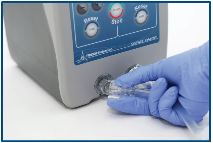
1) Open new tubing package(s). Attach time and date sticker directly to the tubing. Install air tubing set to either of the air output ports located on the lower front of the unit.