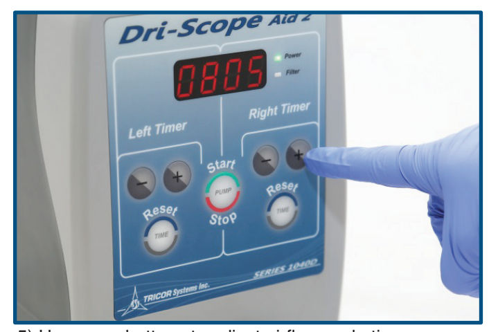
5) Use + or - buttons to adjust airflow cycle time if desired. Time shown in minutes.